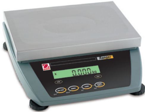
RD15LM, RD35LM models