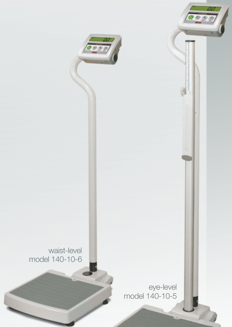
waist-level model 140-10-6