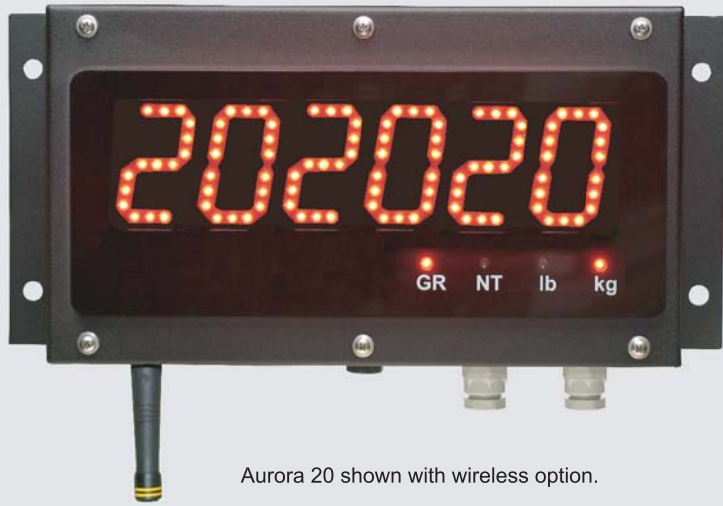
Aurora 20 shown with wireless option.