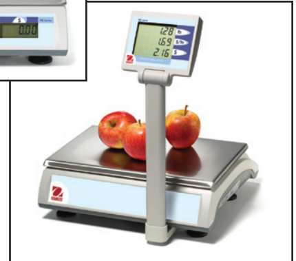
Model RE shown with rear display (top) and tower mount model (bottom)